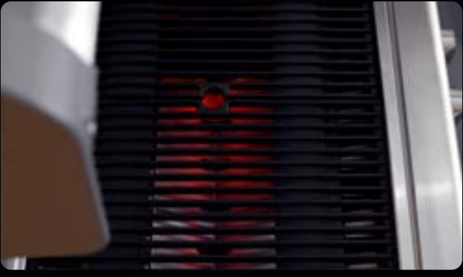
Self cleaning grill with significantly reduced flare ups