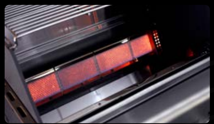
High intensity ceramic infrared burners