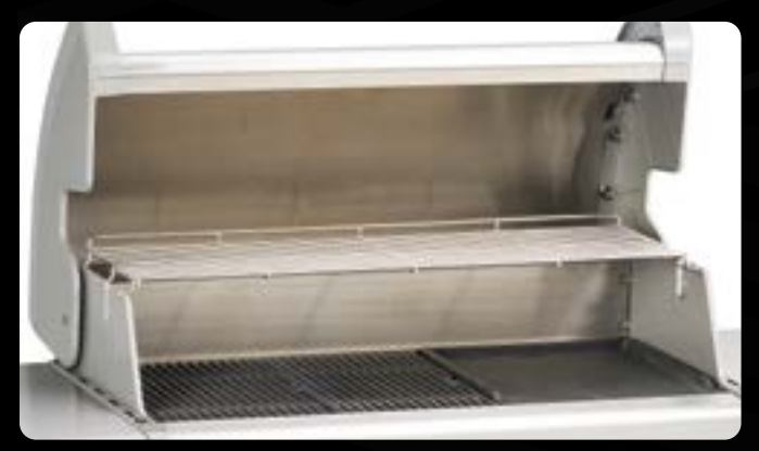
Multipurpose outdoor appliance, lid up or down