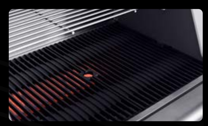
2 piece upper level cooking area