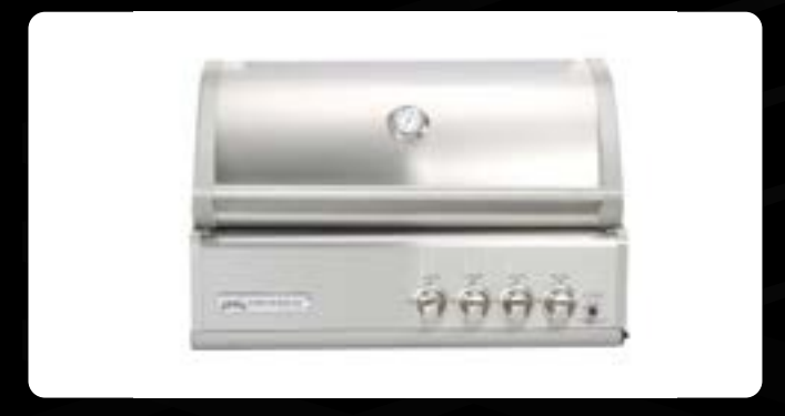
4 burner In-Built BBQ Model TCS4FL