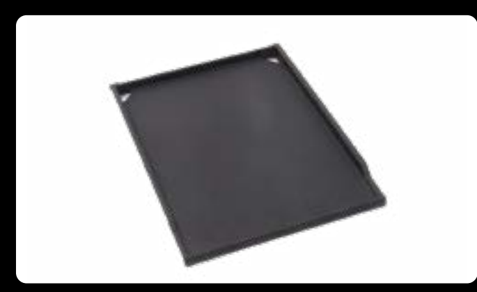
Hotplate TCS4AC-001 - Hotplate (for CROSSRAY Gas BBQ) made from Ceramic coated cast iron.