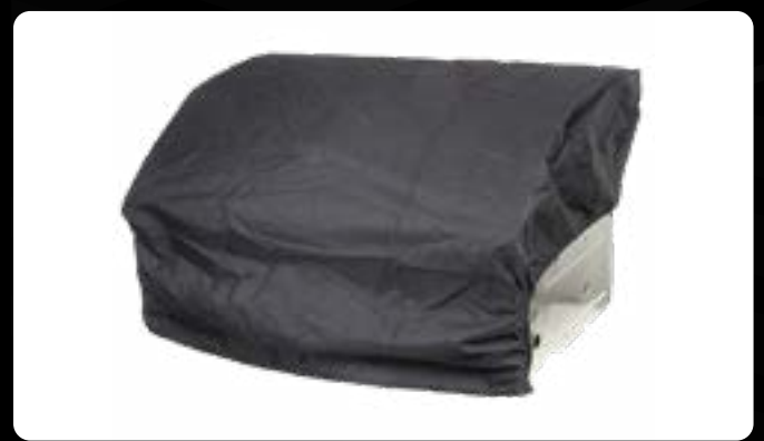
In-Built BBQ Cover TCS4AC-004 - Cover for 4 Burner in-built BBQ Woven polyester.