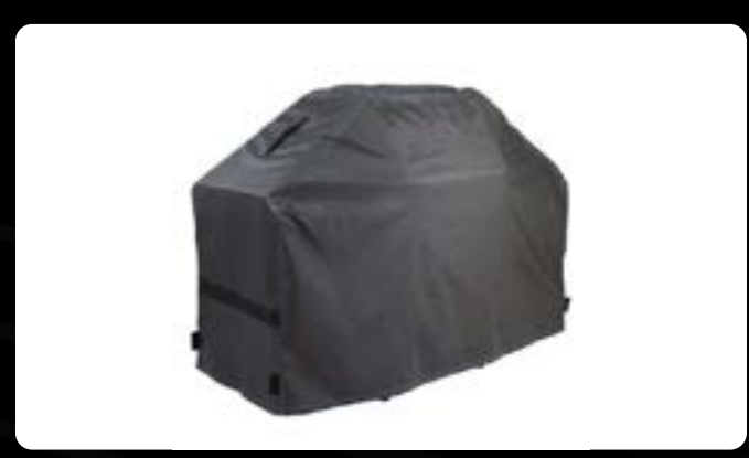
Trolley BBQ Cover TCS4AC-002 - Cover for 4 Burner trolley BBQ Woven polyester.