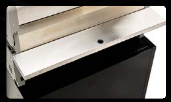
In-Built Rear Kit TCS4AC-009 - Built-in kit for 4 Burner in-built BBQ.