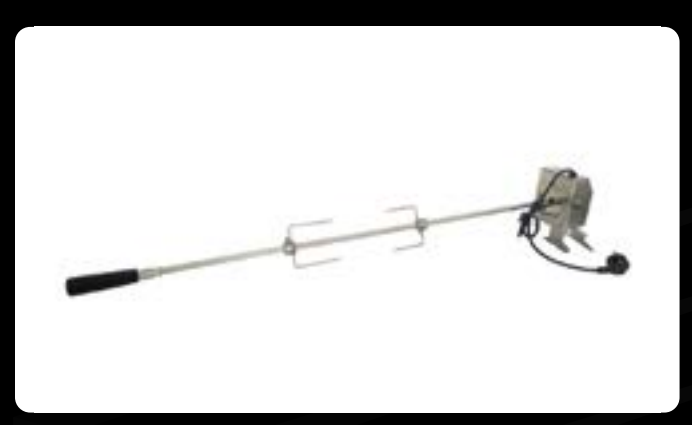
Rotisserie Kit TCS4AC-008 - Rotisserie kit for 4 Burner BBQ.