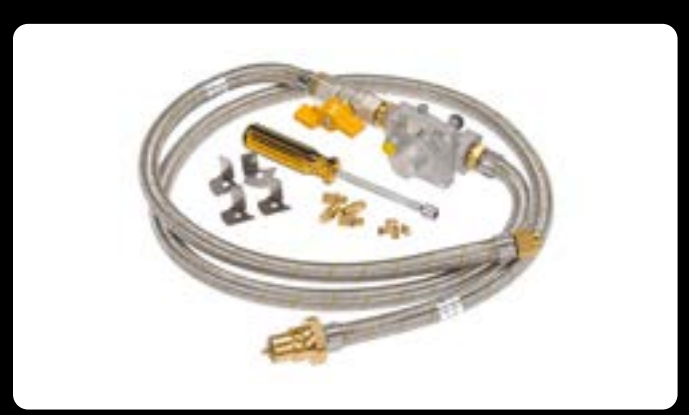
NG Conversion Kit TCS4AC-003 - Natural gas conversion kit - brass jets, Alloy NG regulator.