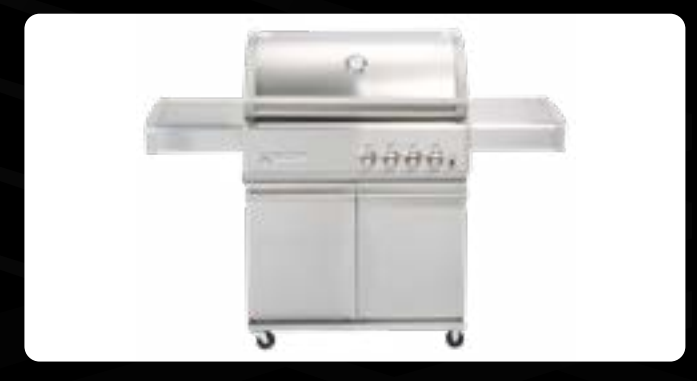
4 burner Trolley BBQ Model TCS4PL

The Range All CROSSRAY BBQ's come with grill plates as standard