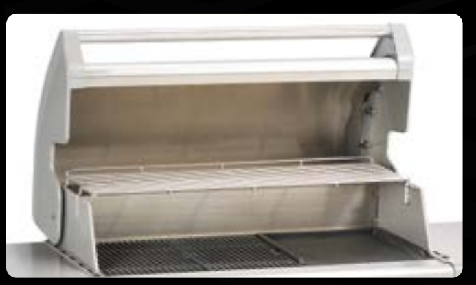
Multipurpose outdoor appliance, lid up or down