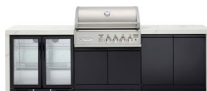
TC4KP-15 (White) | TC4KB-21 (Black) Double side cabinets with flat bench tops and double fridge