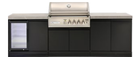
TC4K-07 Double side cabinets with flat bench tops and single fridge