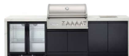
TC4KP-16 (White) | TC4KB-22 (Black) Double side cabinets with 1x flat bench top, under bench sink and double fridge