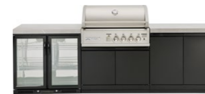
TC4K-09 Double side cabinets with flat bench tops and double fridge