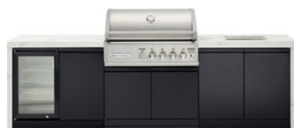
TC4KP-14 (White) | TC4KB-20 (Black) Double side cabinets with 1x flat bench top, under bench sink and single fridge