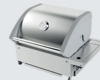
2 Burner Drop In BBQ Model: TCS2IBL