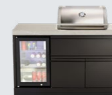
TC2K-MK1 2 Burners Gas BBQ with single fridge