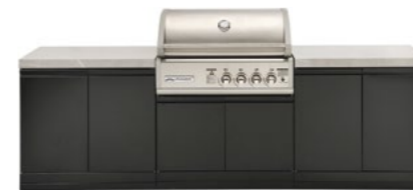
TC4K-05 Double side cabinets with flat bench tops