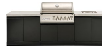
TC4K-06 Double side cabinets with 1x flat bench top and under bench sink