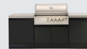
TC4K-MINI2 4 Burners Gas BBQ with flat benchtop

All components of the CROSSRAY Outdoor Kitchens are also available to purchase individually. This includes the the BBQ and side cabinets, flat bench top, under bench sink top, single and double fridge. Please refer to the CROSSRAY website for more information www.crossray.com.au