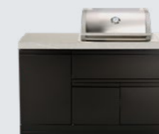
TC2K-MK2 2 Burners Gas BBQ with flat bench top