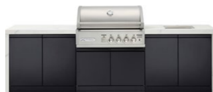
TC4KP-12 (White) | TC4KB-18 (Black) Double side cabinets with 1x flat bench top and under bench sink