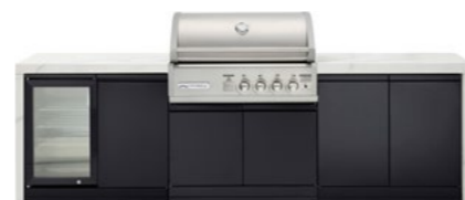
TC4KP-13 (White) | TC4KB-19 (Black) Double side cabinets with flat bench tops and single fridge