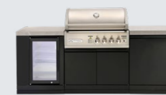
TC4K-MINI1 4 Burners Gas BBQ with flat bench top and single fridge