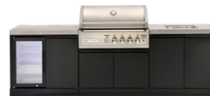
TC4K-08 Double side cabinets with 1x flat bench top, under bench sink and single fridge