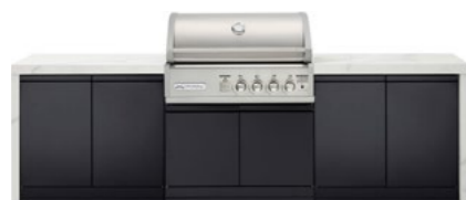
TC4KP-11 (White) | TC4KB-17 (Black) Double side cabinets with flat bench tops