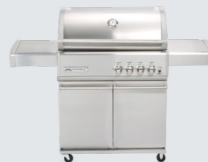
4 Burner Trolley BBQ Model: TCS4PL

All CROSSRAY BBQ's come with grill plates as standard