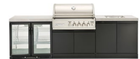
TC4K-10 Double side cabinets with 1x flat bench top, under bench sink and double fridge

Wanting to get the most out of your outdoor space? CROSSRAY offers space-saving BBQ solutions for the avid griller. Entertaining is now possible for everyone, regardless of space.