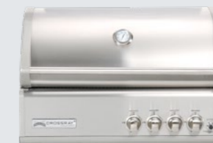
4 Burner In-built BBQ Model: TCS4FL