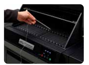
Meat probe included to set the preferred cooking temperature