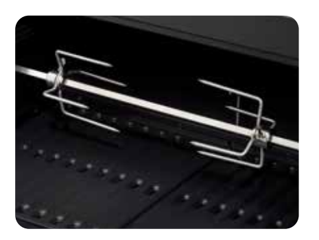
TCEAC-004 Rotisserie kit