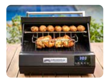
High hood design, includes warming rack