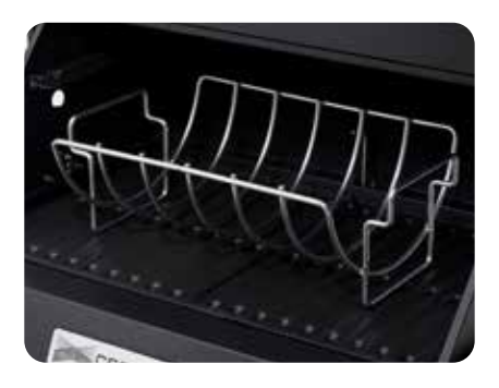
TCEAC-005 Roasting rack