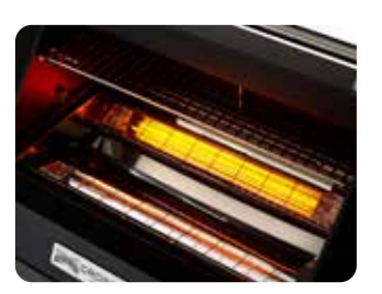
2x 1100W carbon-fibre infrared elements