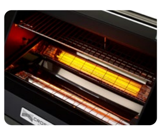
2x 1100W carbon-fibre infrared elements