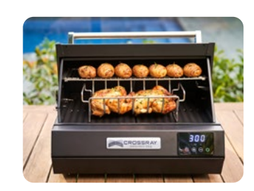
High hood design, includes warming rack