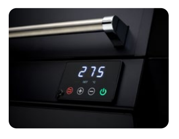
Digital, programmable control panel