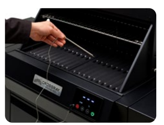
Meat probe included to set the preferred cooking temperature